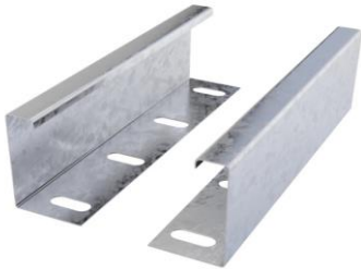
Illustration shown is heavy duty